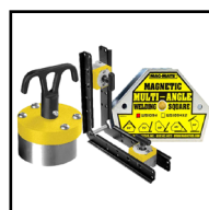
Welding Angles & Squares